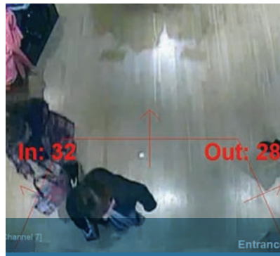
Conversion Rate – Set new goals for your team!

Get a read on store traffic, monitor trends and patterns with our at-a-glance graphics. Validate the success of your marketing efforts, plan your labor accordingly and be ready to serve your customers better with this accurate metric.